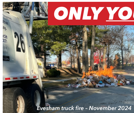
Evesham truck fire - November 2024

Recycle these at Home Depot, Lowes, Staples and other locations listed at www.Call2Recycle.org .