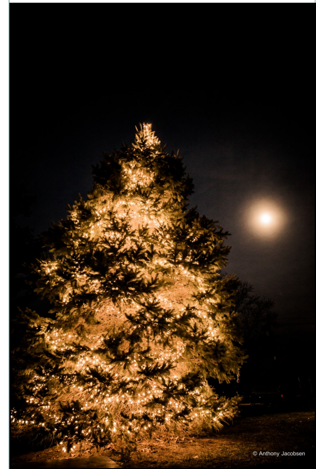
Exhibit Open: December 1 – January 14, 2023