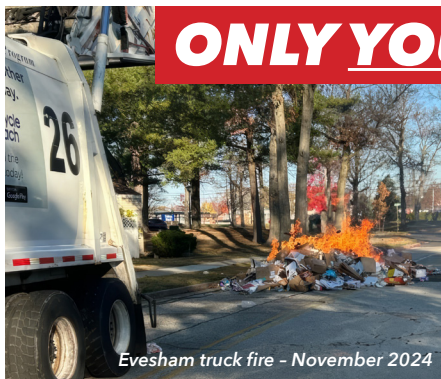
Evesham truck fire - November 2024

Recycle these at Home Depot, Lowes, Staples and other locations listed at www.Call2Recycle.org .