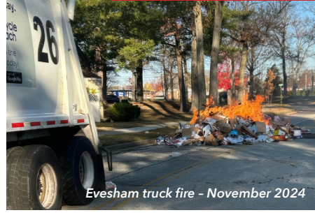
Evesham truck fire - November 2024