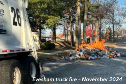
Evesham truck fire - November 2024