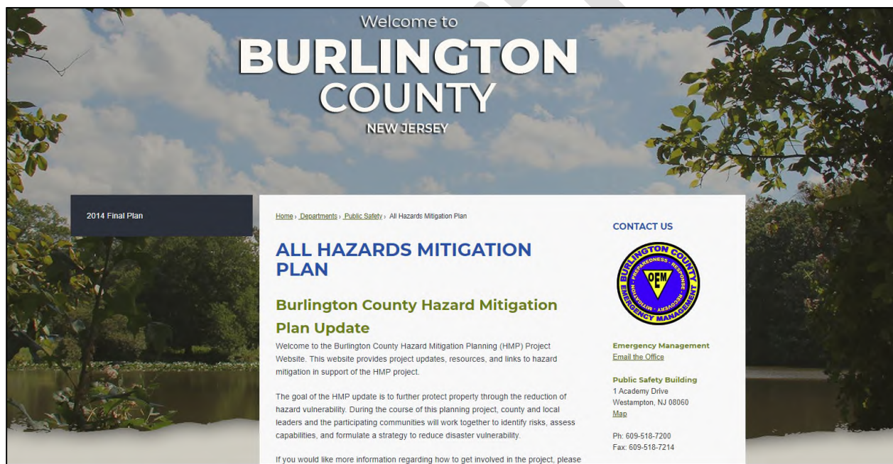
Figure 3-1. Screenshot of the Burlington County Hazard Mitigation Webpage